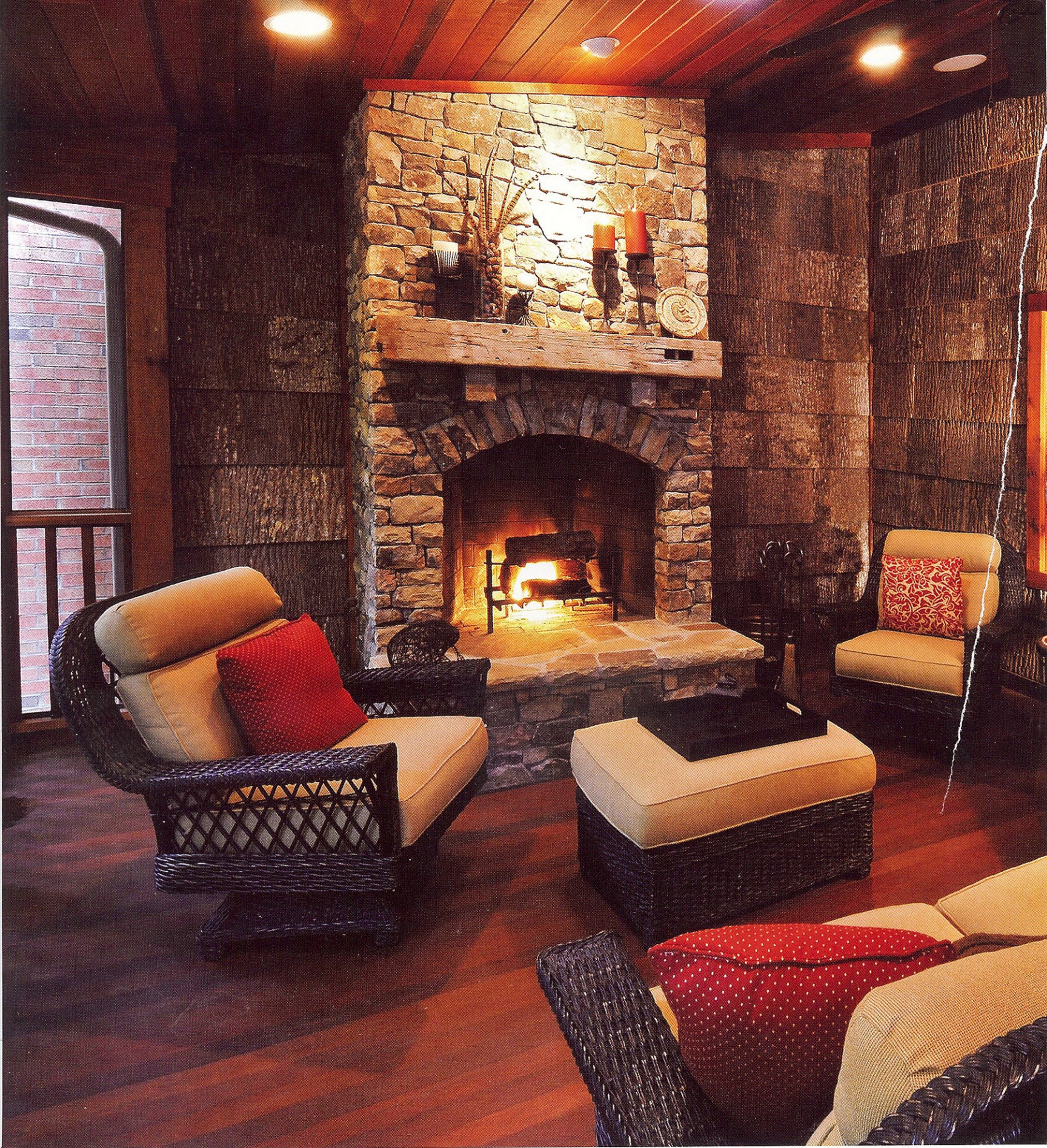
This new screened porch trimmed in rough Poplar bark siding reflects its owners' love of the mountains.