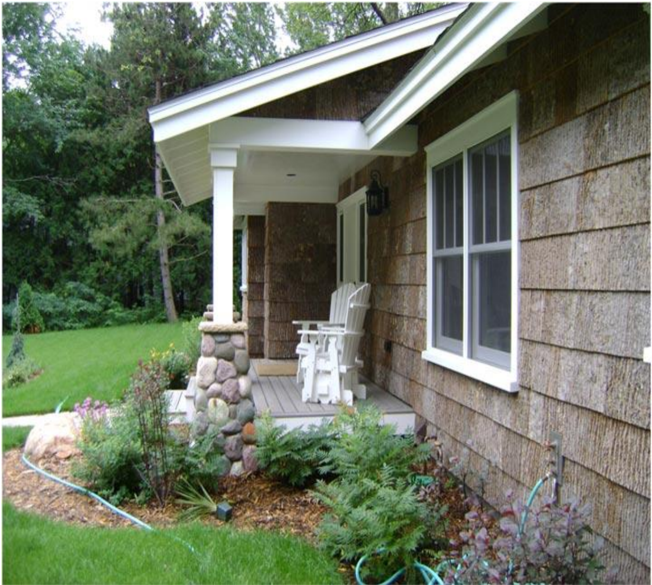
The Cervenka home near Boulder Junction Wisconsin is a new structure where the bark siding and moss green windows help establish its lodge like character.