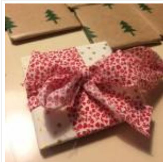
A Change Would Do You Good