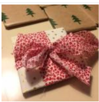
A Change Would Do You Good December 19, 2015