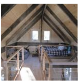
Return To The WEE – Ely Cabin! December 4, 2015