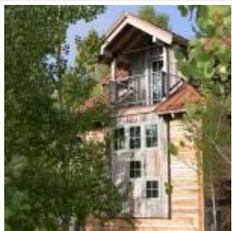
The Ski In – Ski Out Home