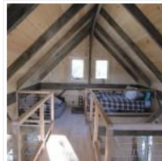
Return To The WEE – Ely Cabin!