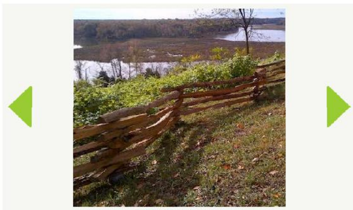
3 of 11