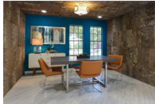
Bark House makes outdoor and indoor building materials made of tree bark

The Appalachian company's shingles don't ever become waste. Instead, when the shingles are done being shingles, they can be composted, giving nutrients back to the Earth. The shingles themselves are totally non-toxic, meaning that they don't contribute to indoor air pollution when installed inside. Added bonus? They're freaking beautiful.