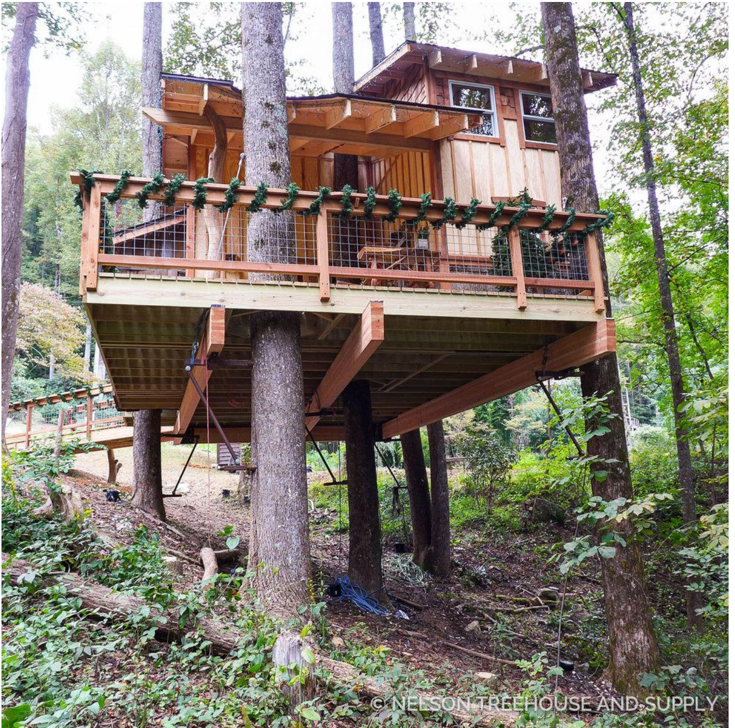
A grove of strong tulip poplars supports the weight of Mike's treehouse, which sits 18 feet up from the ground at its highest end.