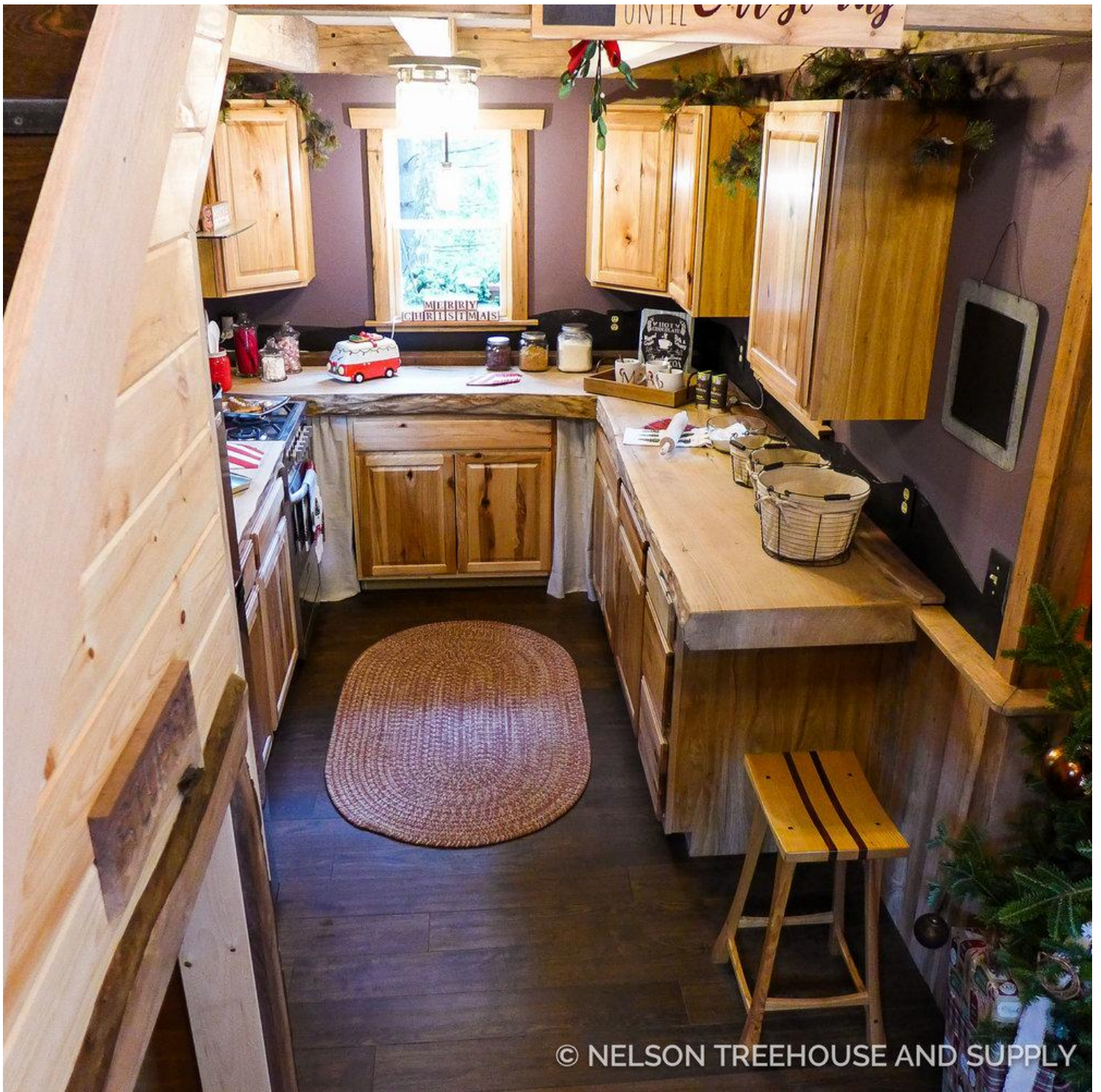
Mike's friend also worked on the steel back splash that runs from the kitchen into the living room.