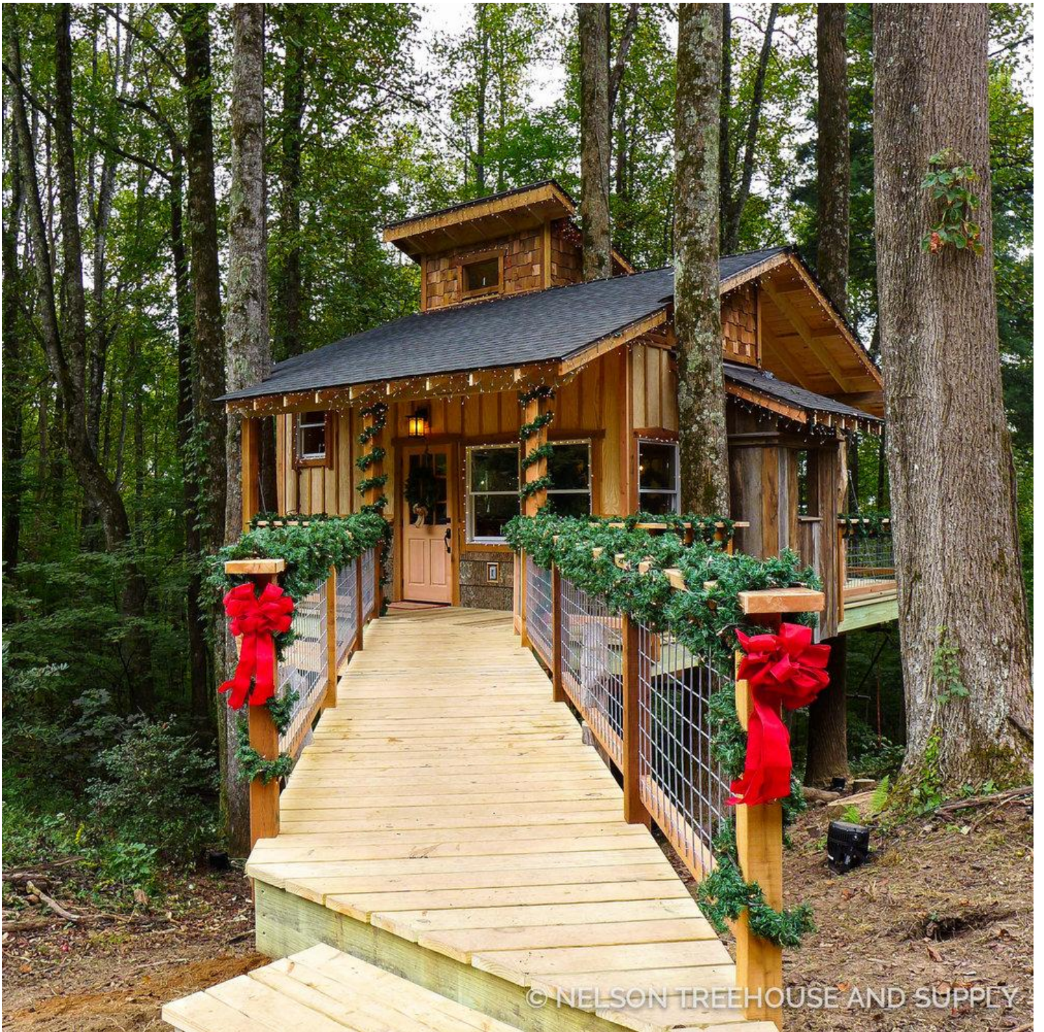
The ramp made for a convenient passage to the treehouse, given the slope of the hill. Classic Nelson Treehouse hog wire railing runs along either side of the ramp.