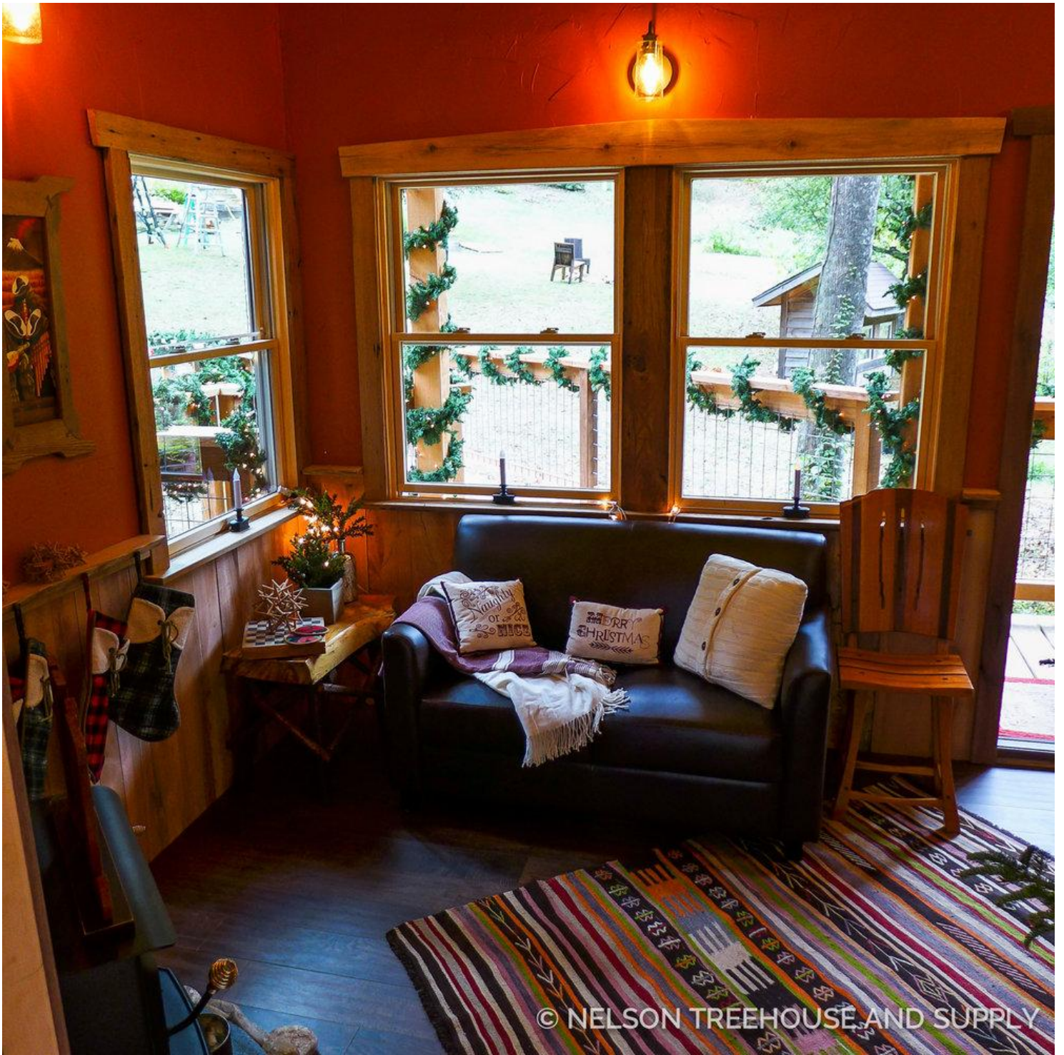
Large windows provide views of the forest.