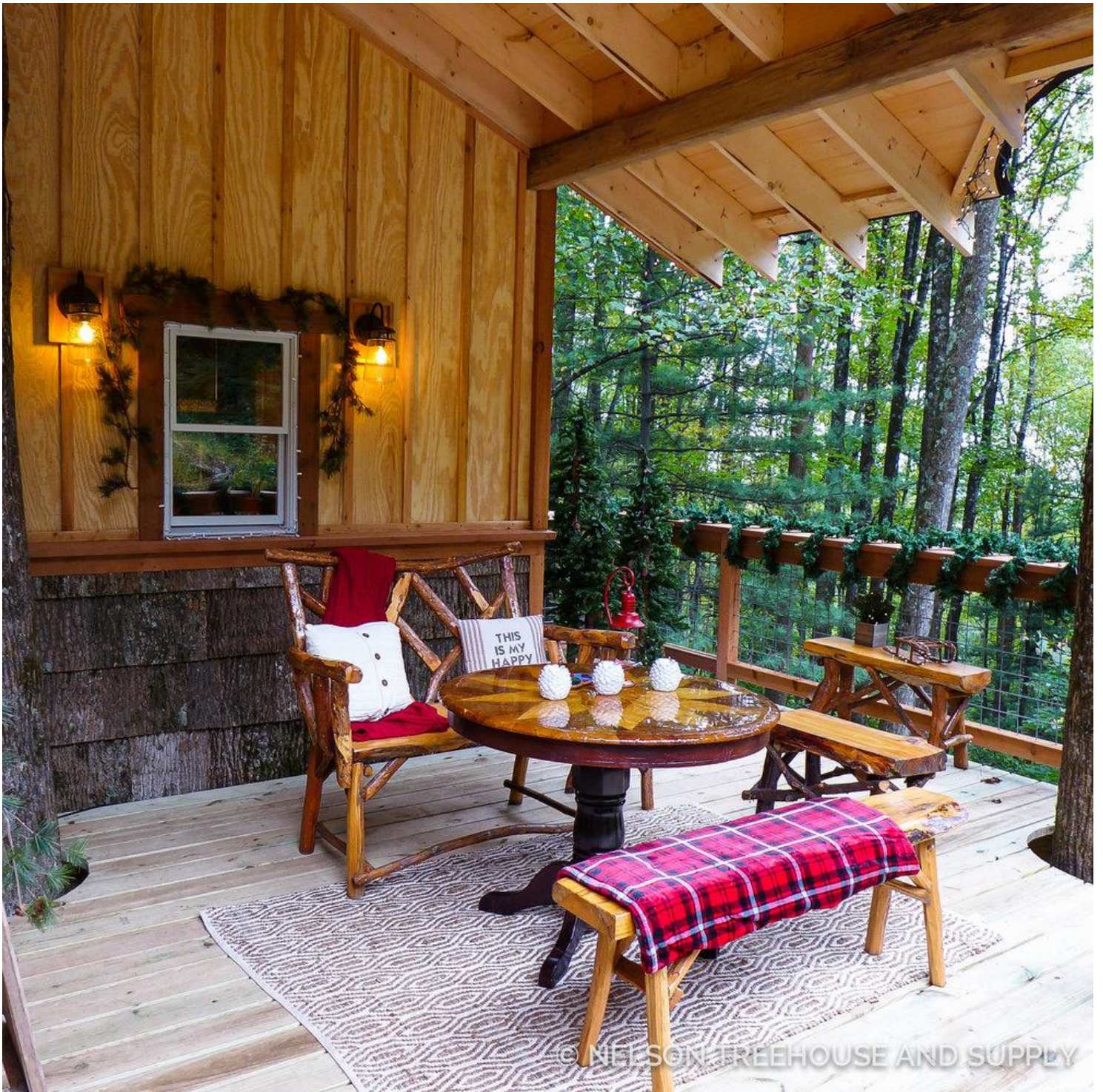
The back deck has plenty of room for an outdoor seating area.