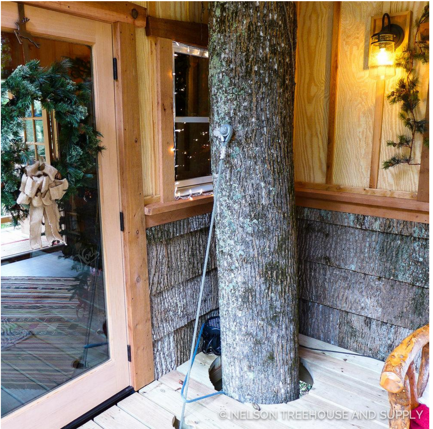
Several poplars poke through the deck, allowing visitors to admire their beauty up close. They also blend in nicely with the poplar bark siding.