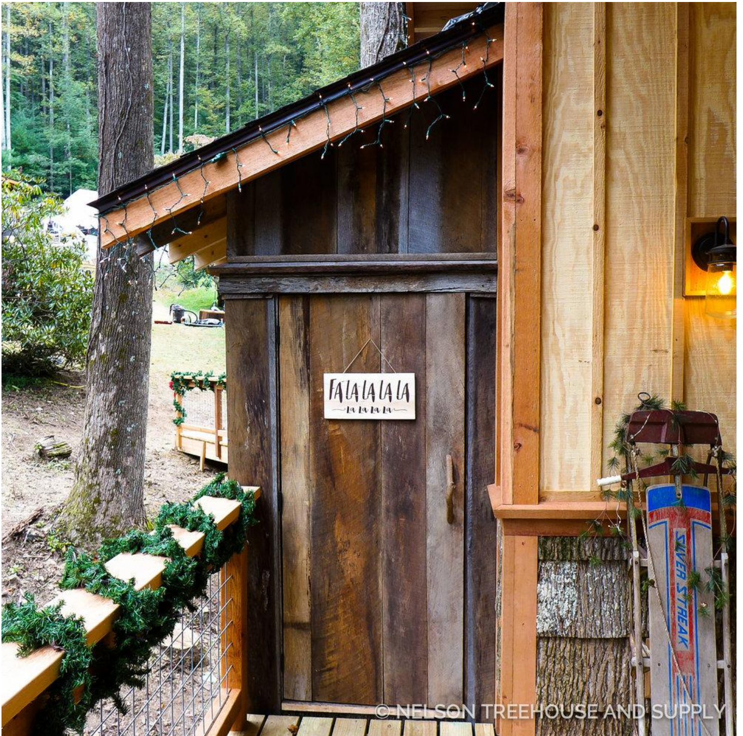
Mike's treehouse includes an outhouse with a compostable toilet.