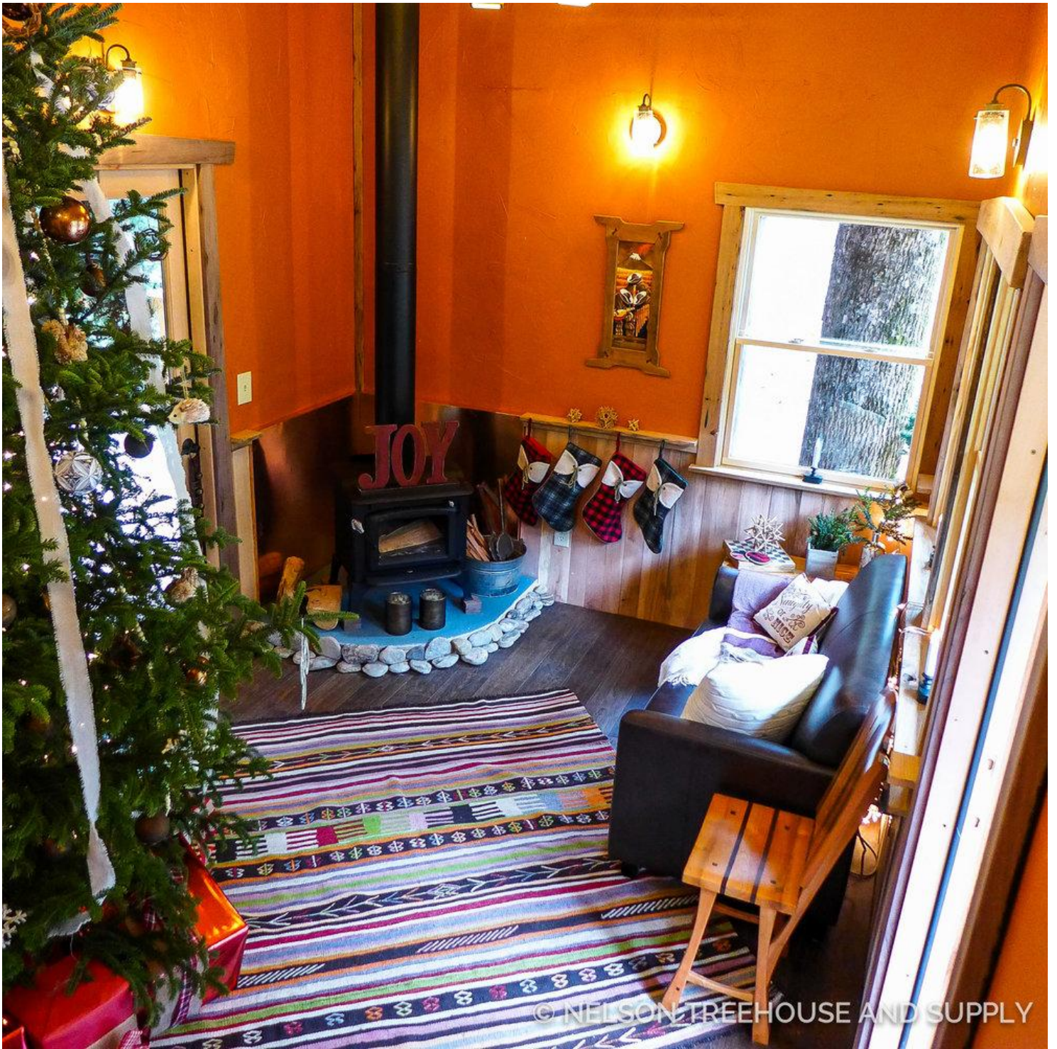
A wood stove keeps the living space warm and toasty.