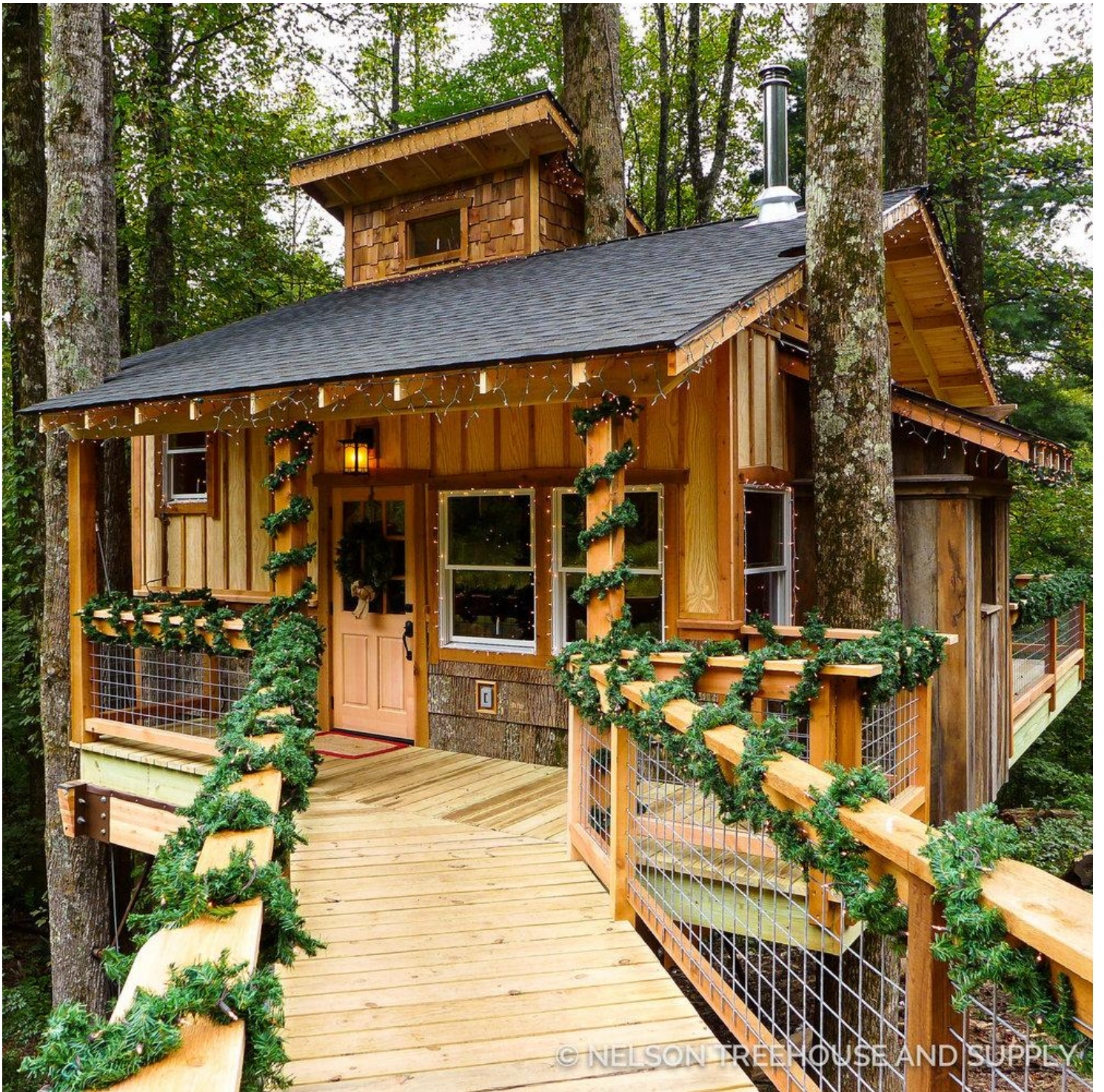
The front deck is sheltered by the roof's overhang.