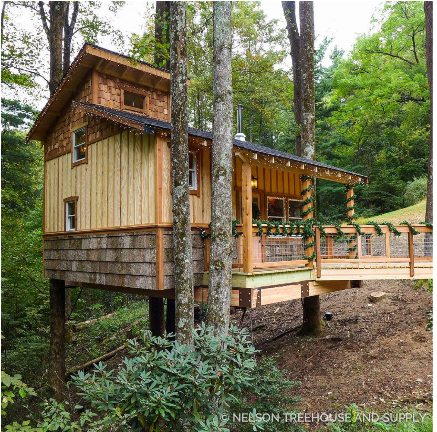
The bottom portion of the exterior is clad in poplar bark siding. Cedar board and batten covers the middle section, and cedar shakes pepper the top.