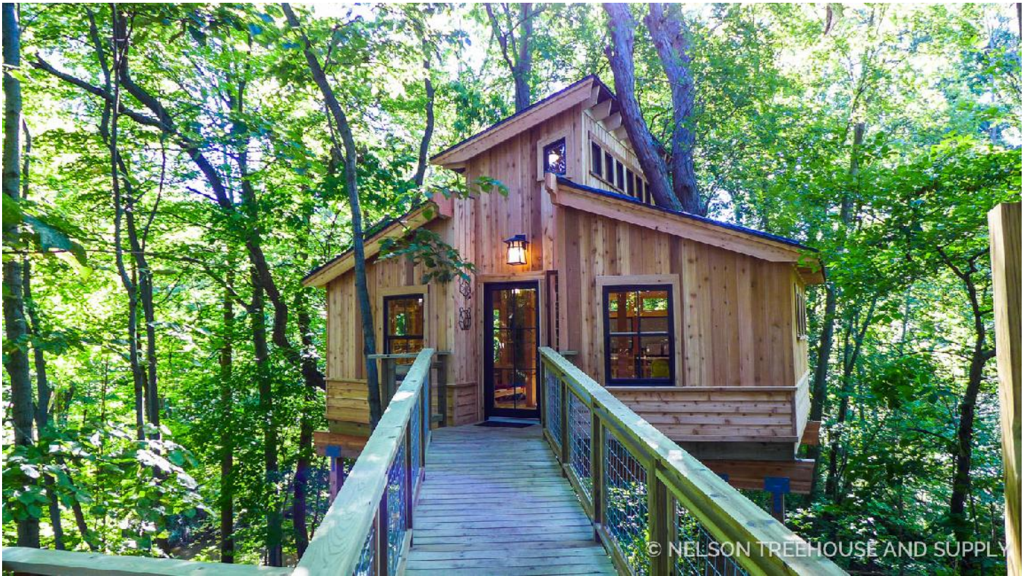
Photo Tour: Nature's Super HQ Treehouse at For-Mar Nature Preserve

Did you see Friday night's episode of Treehouse Masters? Read on for behind-the-scenes details (including Patrick's reminiscences of the build and a statement from our clients at For-Mar Nature Preserve) and a photo tour of Nature's Super HQ treehouse!