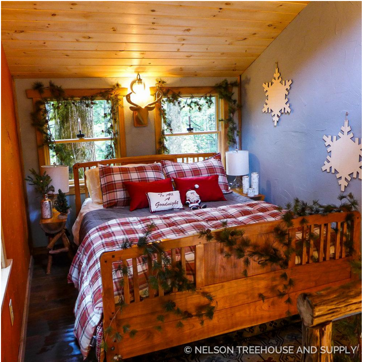
The loft fits a queen-sized bed.