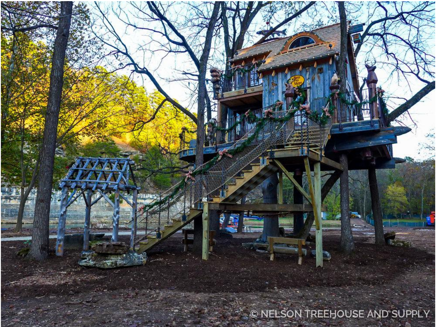
Two levels of decks give visitors sweeping views of the surrounding Ozarks.