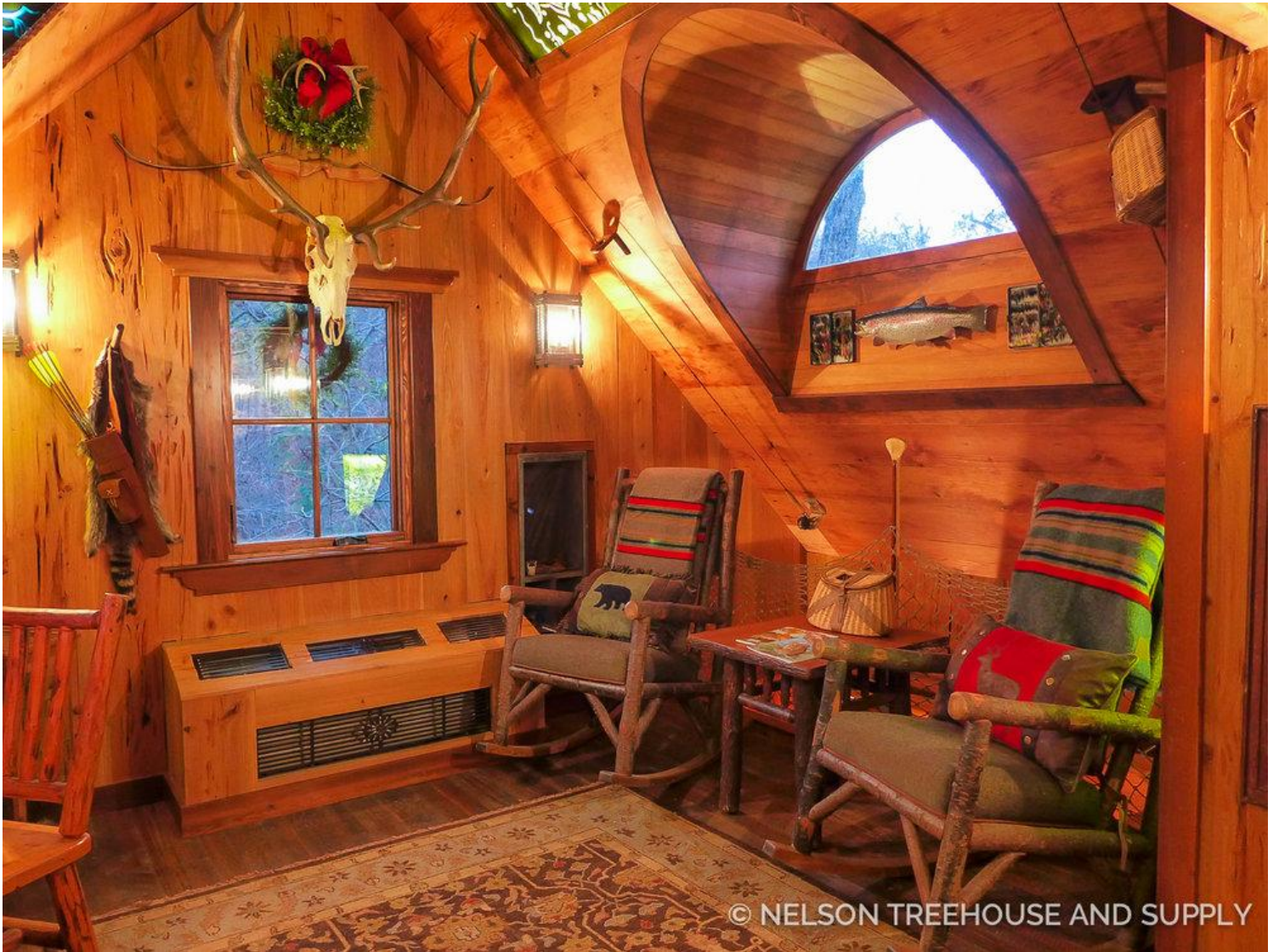
Our carpenters really went above and beyond with this eyebrow window; their craftsmanship is superb!