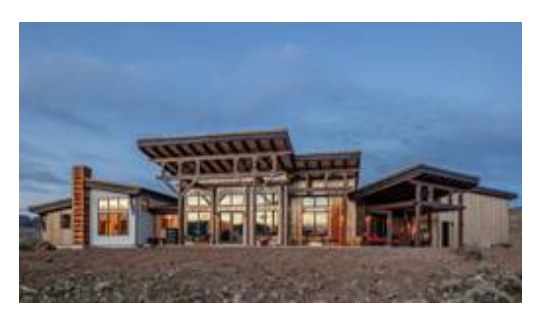
This Home Has Rusted Roots