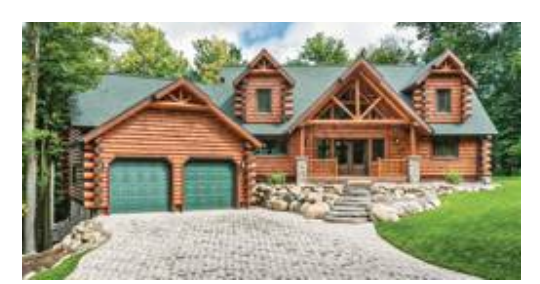
Coming Together at this Wisconsin Hybrid Home