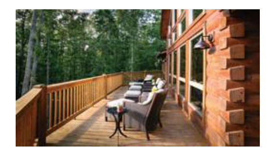
This Home is the Cure for Cabin Fever