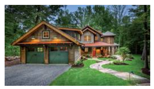
A Natural Beauty in Maryland