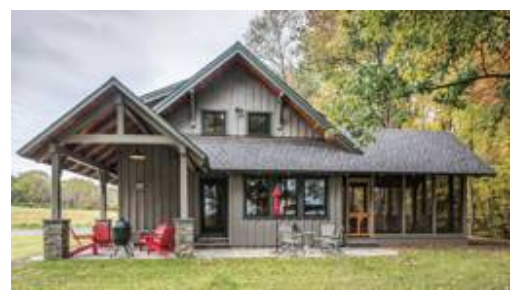
Living the Sweet Life in this Timber Frame Beauty