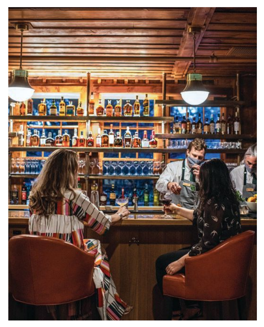
The bar at High Hampton is the perfect place to grab an evening cocktail with friends