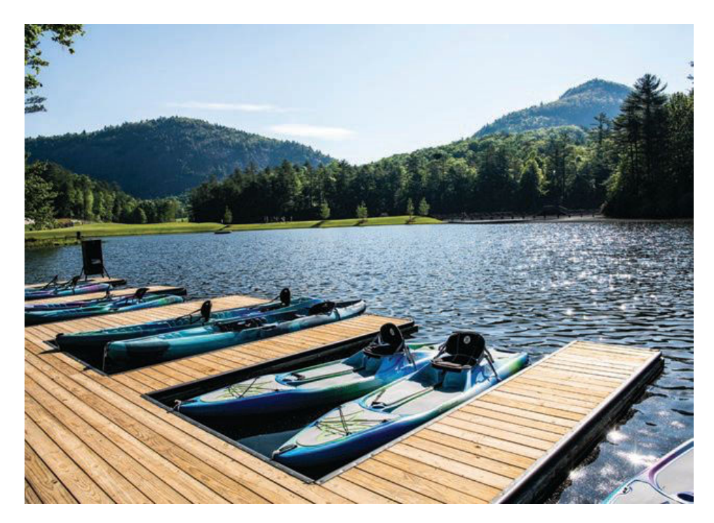
Hampton Lake offers a variety of activities for all ages including kayaking, canoeing, fishing and more.